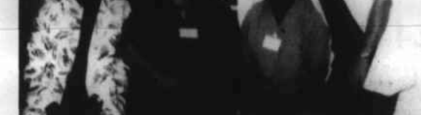
The staff of Eagle Lake Home Care are dedicated to providing patients in Eagle Lake and surrounding communities with the best personalized, quality care and teaching to allow patients to remain in their homes during illness or debilitating states.

We are very proud of our nurses. They continually strive to improve their skills and their patient care. A salute to the nurses of RDCH.